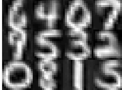
Figure 3: Cluster means obtained by the proposed BMSSR model